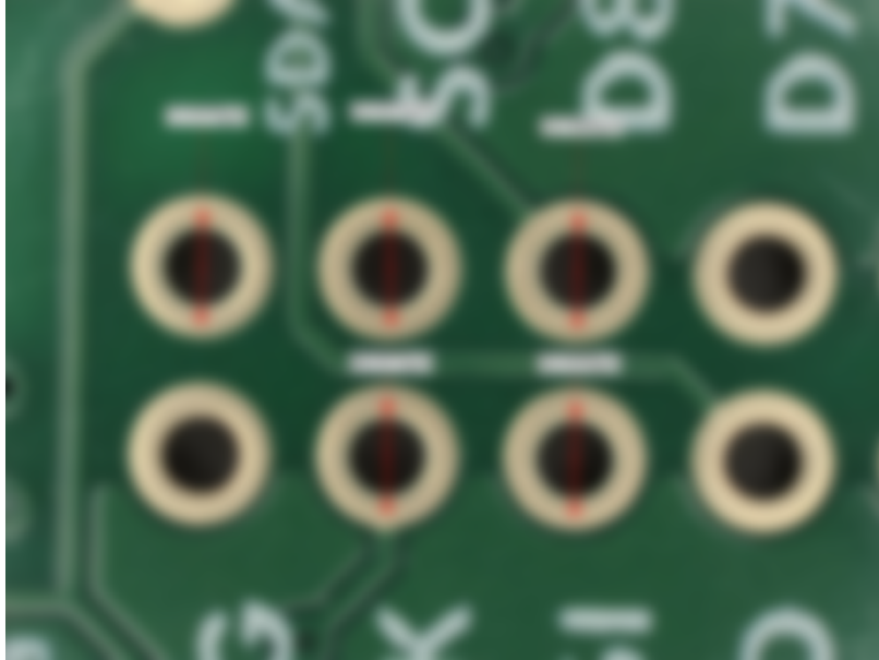
Test photo(s) of sample A2250553251101001 ( 20~150X )

Remark: The testing data and result(s) in this report is(are) just for scientific research, education, internal quality control and product development etc.